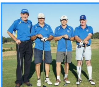
Match Play semi-finalists

The Match Play final will be played at The Dunes on 27 February.