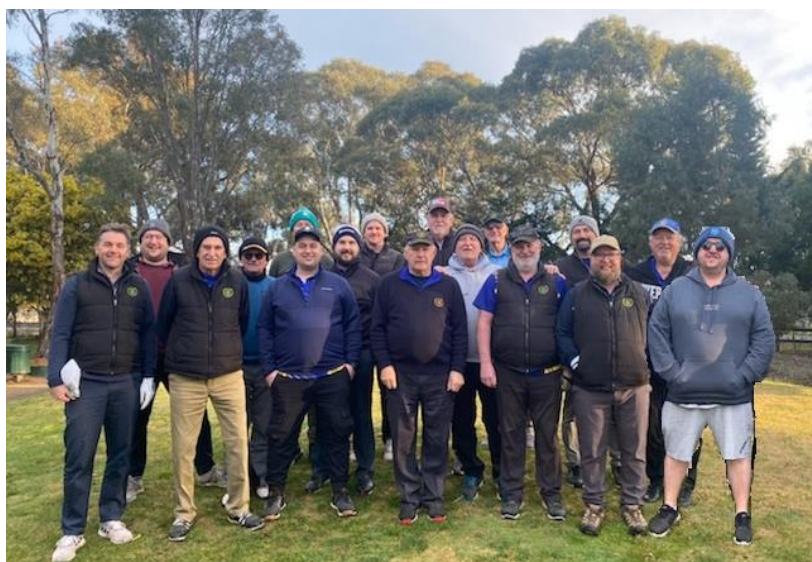
Too cold to just wear our club shirts without jackets/vests!