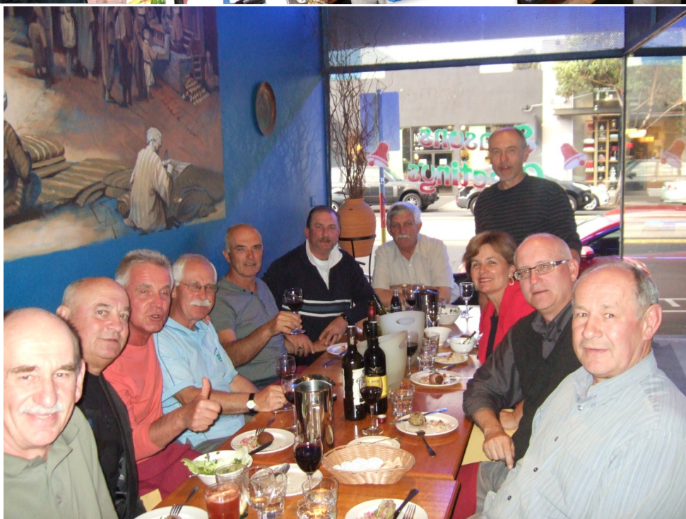
Your committee enjoying a well-earned end-of-year celebration.